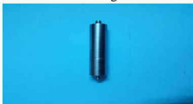
Fig 2 : Double Sided Cylindrical Pin

A non-consuming HRC material tool was used to fabricate the welded joints [15][16][17]. A double sided cylindrical pin was used as the welding tool. The tool has shoulder diameter, pin diameter and pin length of 18 mm, 6 mm and 5.7 mm respectively. This was shown in Figure-2.