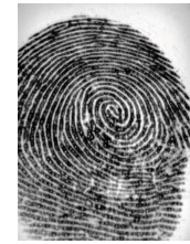
(d) after histogram equalization