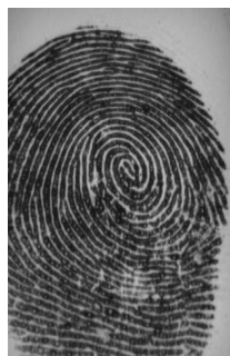
(b) cropped image and resized