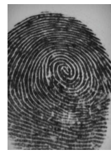
(c) after median filtering