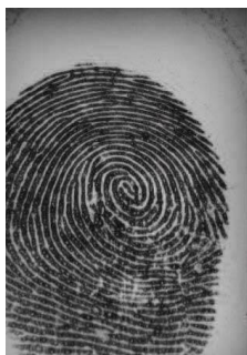
(a) Original image

A poor quality fingerprint image is typically noisy, exhibits smudged line and has low contrasts between valleys and ridges. These effects can happen during image acquisition, due to dry or wet skin. Since the image acquisition stage is not always monitored for accepting only high quality images, fingerprint image enhancement and noise reduction are, therefore, important pre-processing factors in accurately detecting fingerprint liveness.